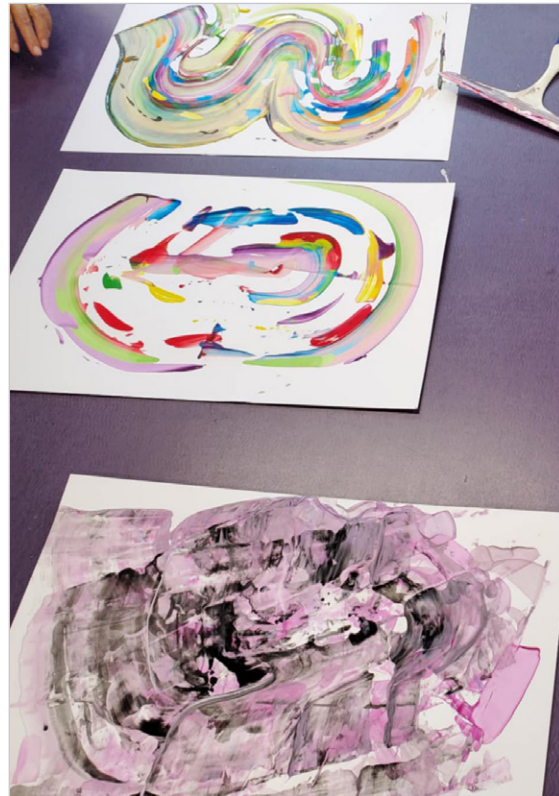
Example of artistic work made during Art Links visits.

The Art Links program is a partnership between the Montreal Museum of Fine Arts' Sharing the Museum program and the Alzheimer Society of Montreal.