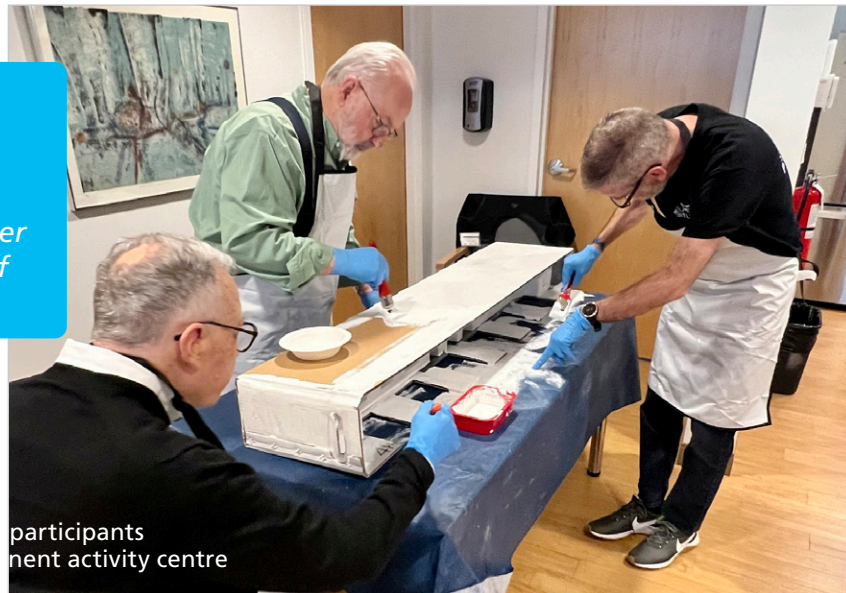
participants ment activity centre

Please note that the Permanent Activity Center will be closed between December 23, 2023, and January 12, 2025. The Center will reopen on the week of January 13th.